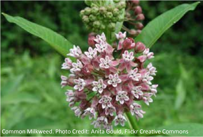
Common Milkweed.

The Ohio Pollinator Habitat Initiative from last fall resulted in approximately 2,500 gallons of milkweed pods collected throughout the state. Thank you to everyone who contributed to this effort in Warren County.