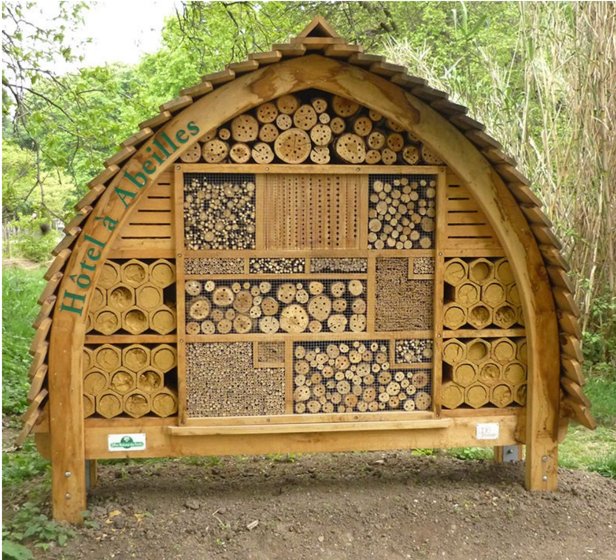
Figure 4: Elaborate Insect Hotel for Inspiration