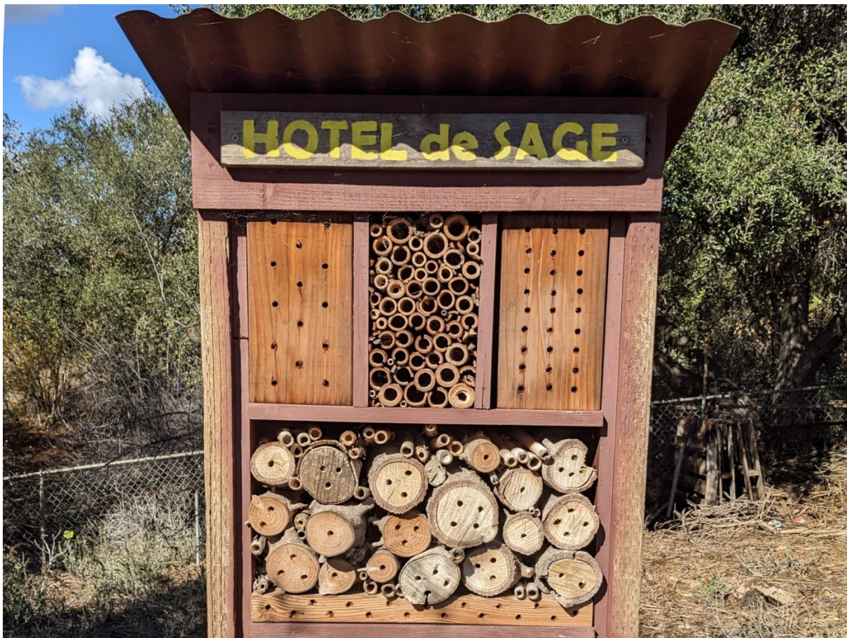
Figure 1: Insect hotel with corrugated metal roof.

Many insect hotels are used as nest sites by insects including solitary bees and wasps. Insect hotels are popular amongst gardeners and fruit and vegetable growers due to their role of encouraging pollinators. Some elaborately designed insect hotels may also be attractions in their own right. Below are some additional pictures of insect hotels that can offer some creative inspiration.