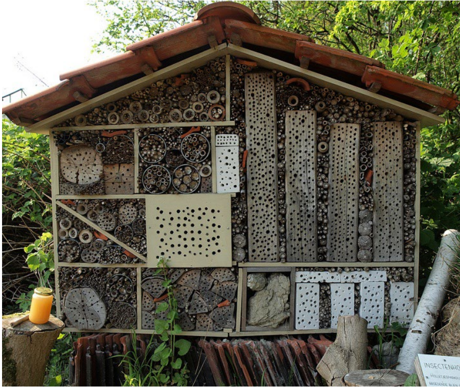
Figure 2: Insect Hotel with multiple sections providing nesting sites and shelter for various types of insects and pollinators.