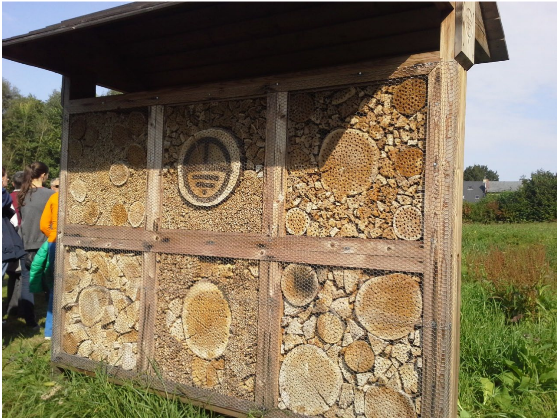
Figure 3: Insect Hotel with wire mesh added to help keep animals out.