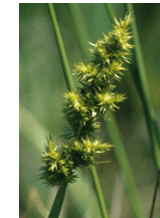
Stalk Grain Sedge