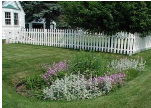
Example of a back-yard rain garden.