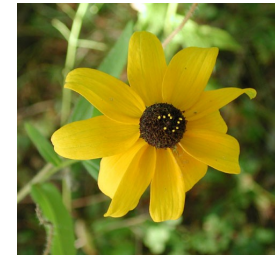
Sweet Black Eyed Susan