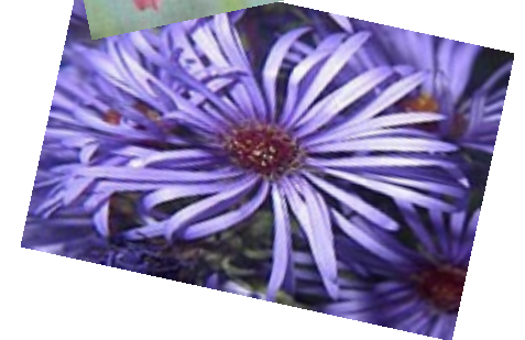
Arrowhead, New England Aster, Purple Coneflower