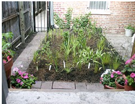
Example of a patio or back-deck rain garden.