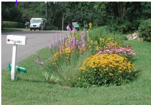
Example of a front-yard rain garden.