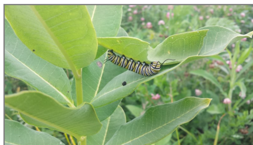
Monarch caterpillar foraging on C. milkweed

Site Preparation: Site preparation is one of the most important and often inadequately addressed components for project success. Too often this step is rushed resulting in poor establishment along with weed control problems. It is very important to address this step with planning and patience.