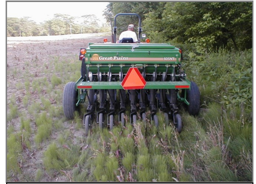
Native grass drill