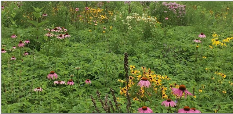
Pollinator Planting

Pollinator plantings are a great way to improve pollinator habitat and biodiversity. Planting native herbaceous and woody species that are beneficial to pollinators throughout the landscape will prove to not only be attractive to pollinators, but also aesthetically pleasing to the eye.