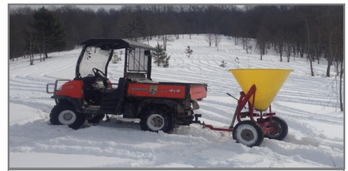
UTV and broadcast seeder