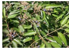
Silky Dogwood ( Cornus amomum )