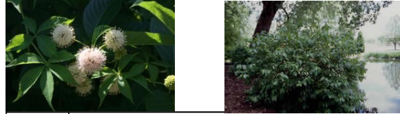
Buttonbush ( Cephalanthus occidentalis )