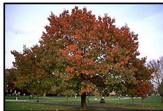
Northern Red Oak form