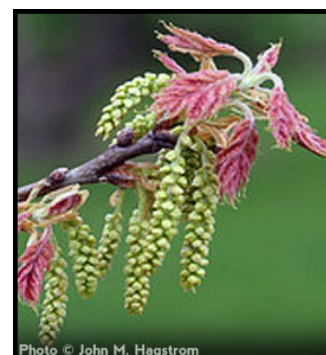
Northern Red Oak foliage with cat-skins